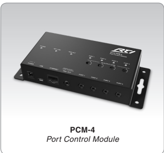
PCM-4 Port Control Module