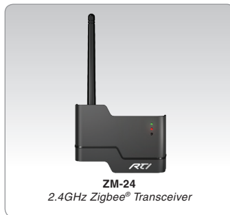
ZM-24 2.4GHz Zigbee® Transceiver