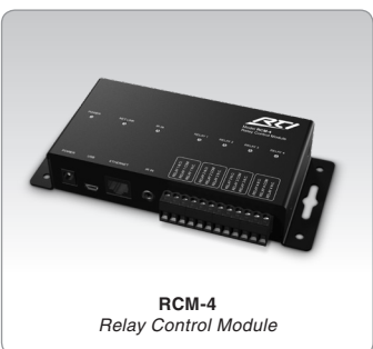
RCM-4 Relay Control Module