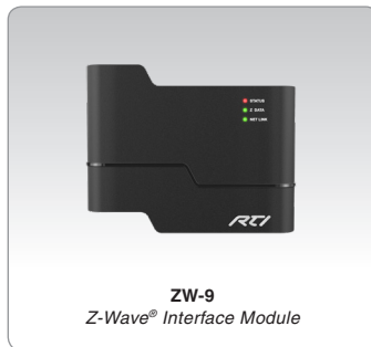
ZW-9 Z-Wave® Interface Module