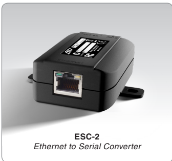
ESC-2 Ethernet to Serial Converter