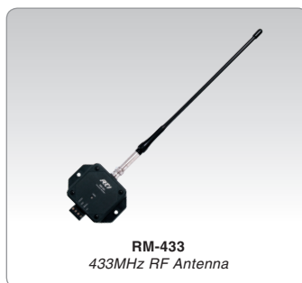
RM-433 433MHz RF Antenna