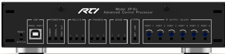
Front view - cover removed